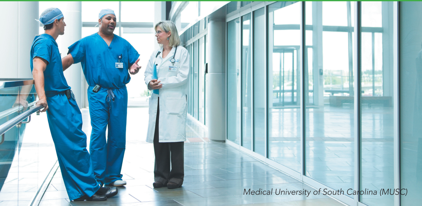
Medical University of South Carolina (MUSC)

JEDA SOUTH CAROLINA Jobs-Economic Development Authority